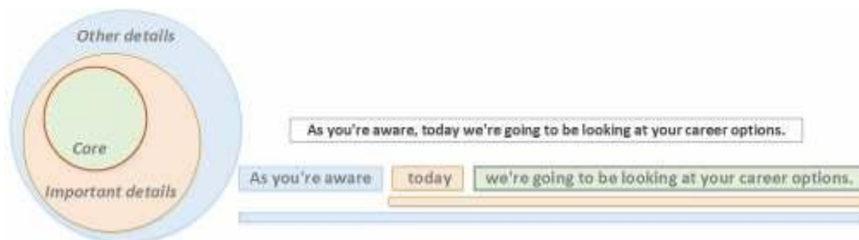
Figure 2 – Evaluation of the parts of the expression

According to frame-based paradigm, each sentence can be represented as a number of ordered slots (terminals and non-terminals) connected with the terms (variants of expression parts represented by the slots). Some slots are strongly required to be filled with the values others are optional ones. The collection of required slots forms the semantic core of the expression: the meaning cannot be passed if the slot is not filled with a proper value. Optional slots can be omitted, their task is to add some details needed to understand the message (Fig.2).