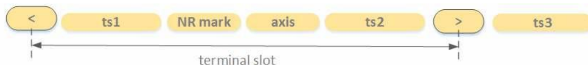
Figure 4 – The structure of the slot

Notably, that any part of the expression can be transformed into slot, means the selection is not connected to grammar structures (part of speech etc.). The value of the slot can be represented by the frame having some slots (Tt1 = today <*Tt>). The structure of the slot is shown in Figure 4. As we can see there are some additional facets (ts1, ts2, ts3) directed to make