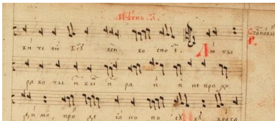
Figure - 1. A page of Lyubachiv irmologion